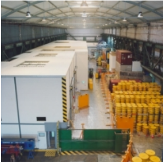
Hall 1/operating phase

In Duisburg-Wanheim, GNS has operated a facility for the packaging of low- to intermediate-level radioactive waste from the operation and decommissioning of German nuclear power plants since 1985. For this purpose, the waste was compacted, dried and packed in containers suitable for interim storage and final disposal.