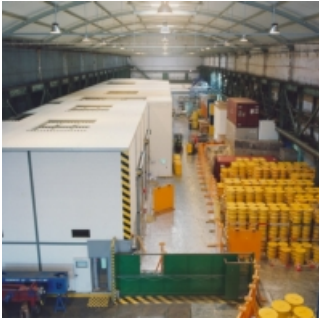
Hall 1/operating phase

In Duisburg-Wanheim, GNS has operated a facility for the packaging of low- to intermediate-level radioactive waste from the operation and decommissioning of German nuclear power plants since 1985. For this purpose, the waste was compacted, dried and packed in containers suitable for interim storage and final disposal.